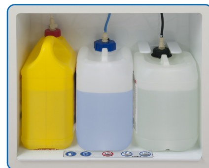
SERIE ENT / SERIE TEE