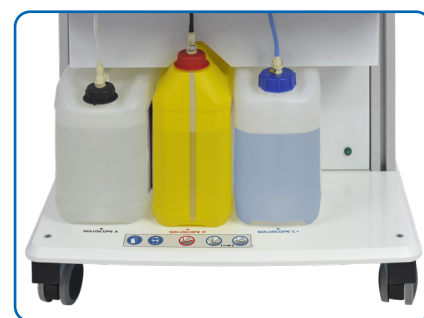
SERIE 3 PA version